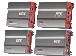
TR275, TR450, TX2275, TX2450