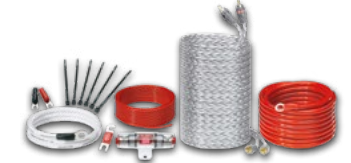
Power kit : ZNX8K ZNX10K